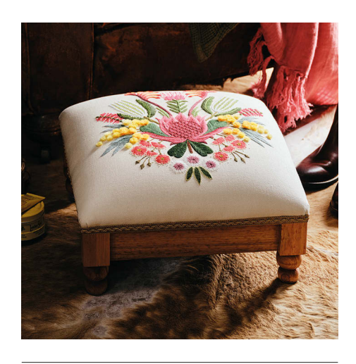
PUT YOUR FEET UP